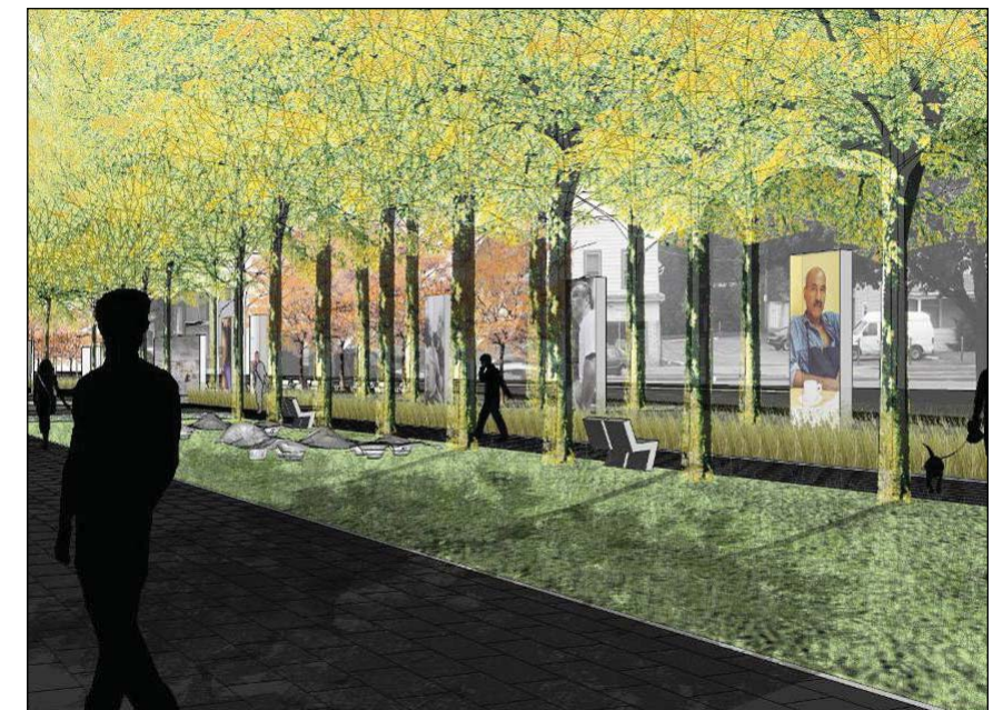
An opportunity exists to improve the quality of some of the existing public parks along the Corridor, such as in this proposal for Dickerman Park.

A number of opportunities have been identified to improve or expand existing public spaces. In some cases, the recommendation is to turn parks from parking lots into public open spaces, in others, it is to improve the public accessibility and quality of the space. In all cases, the intent is to encourage better utilization of open space as part of an enhanced and “green” Central Corridor.