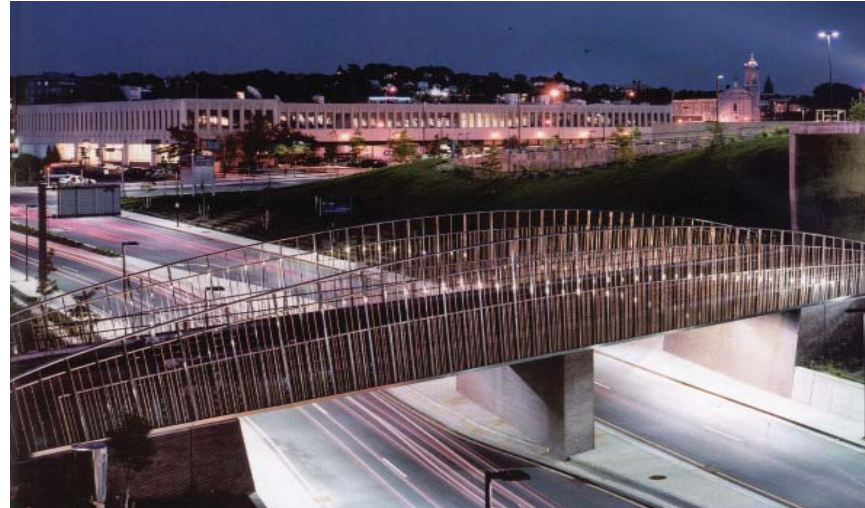
A pedestrian bridge in Worcester, Massachusetts demonstrates the value of an integrated public art strategy by creating an elegant yet functional structure above a busy freeway.