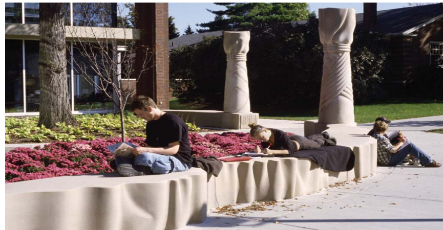
Unique seating built into the planter at the entry to Macalester College's Student Services Center creates an inviting place to sit, read and relax.