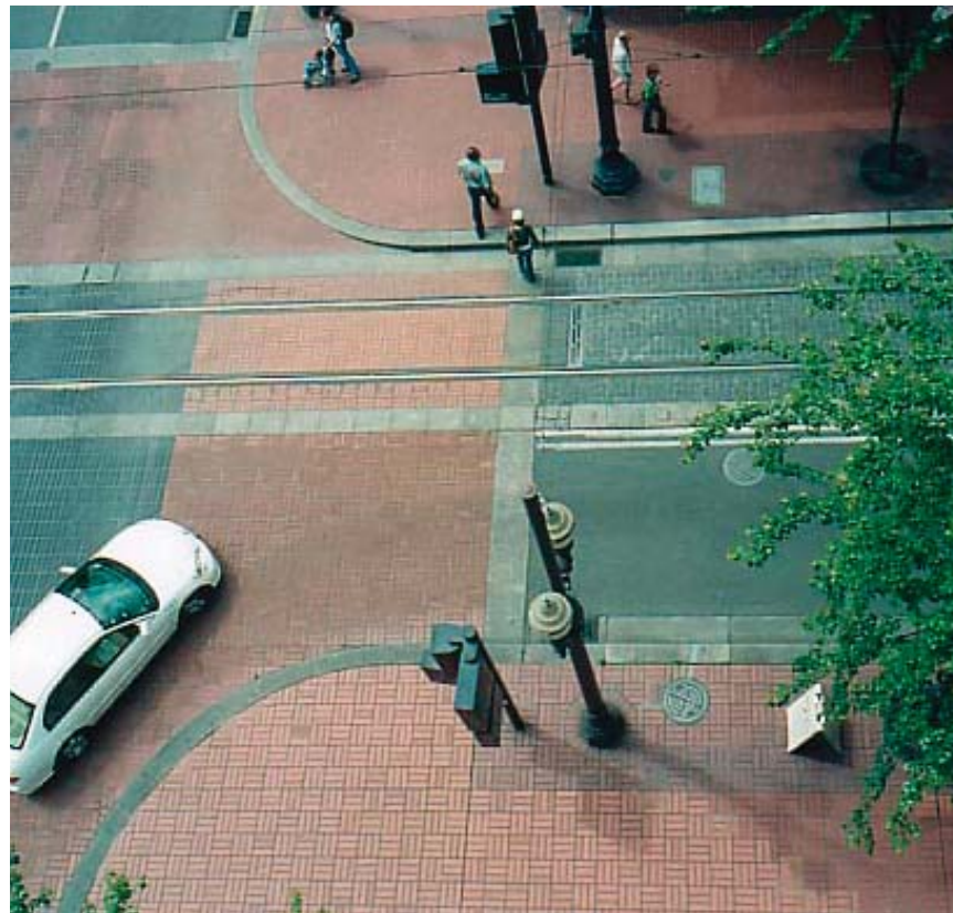
An LRT Zone in Portland, Oregon illustrating the generous crossings and decorative paving that help to enhance legibility and create a comfortable place for both pedestrians and vehicles using the street.

It is at station areas where this concern for the integration of movement modes is of greatest concern. Here, emphasis should be placed on the ease and safety with which pedestrians can get to and from LRT. In practice, this means extending this zone of pedestrian priority to the next point of transfer, whether it be bus, bicycle, or a walking destination. Along the Central Corridor, it is these areas that have been designated as LRT Zones.