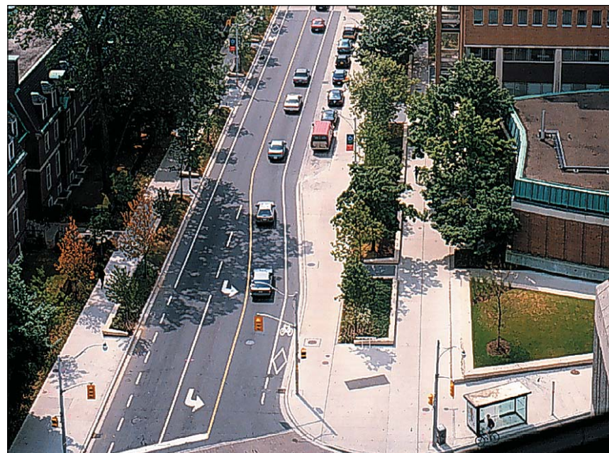
A “Green Boulevard” in Toronto demonstrates a double row of trees, an enhanced pedestrian environment that is buffered from the street by a strip of planting and dedicated bicycle lanes.