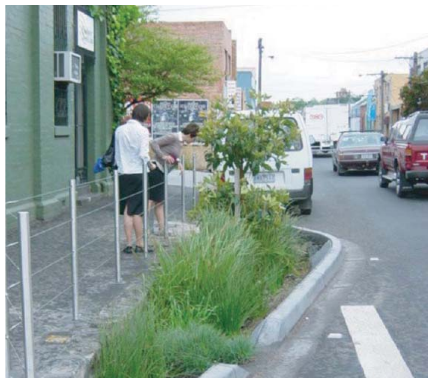
A bio-swale incorporated into a bump-out in Melbourne, Australia greens the street and helps to filter water runoff.