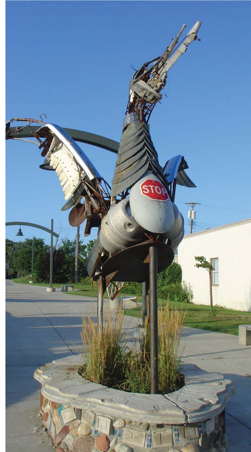
A creative sculpture west of Fairview creates a playful gateway into a pedestrian walk.