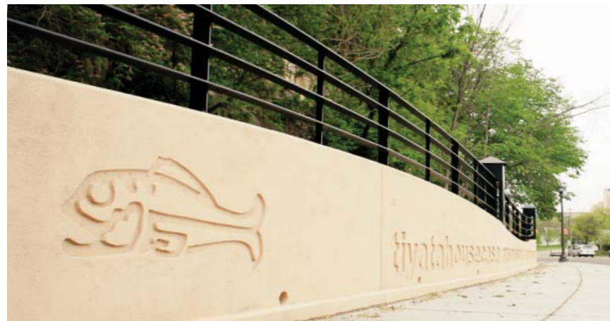
Combining art and engineering, the incorporation of artistic thinking and direction from the outset allowed what would otherwise be just another retaining wall to become a pleasant work of art along Wabasha.