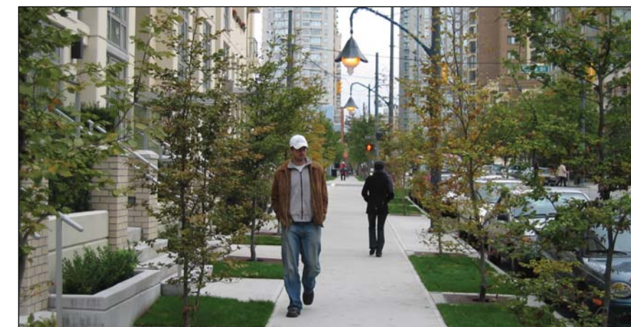
Enhanced landscaping, pedestrian oriented lighting and on-street parking along this street in Vancouver, British Columbia help to improve pedestrian conditions along a busy stretch of road.